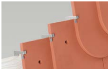
Beaver crown tile roofing

What's more, tower plain tiles can also be fixed with the 425.